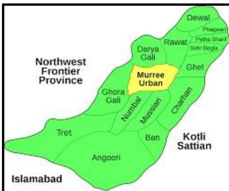
Figure 1: Map of Tehsil Murree